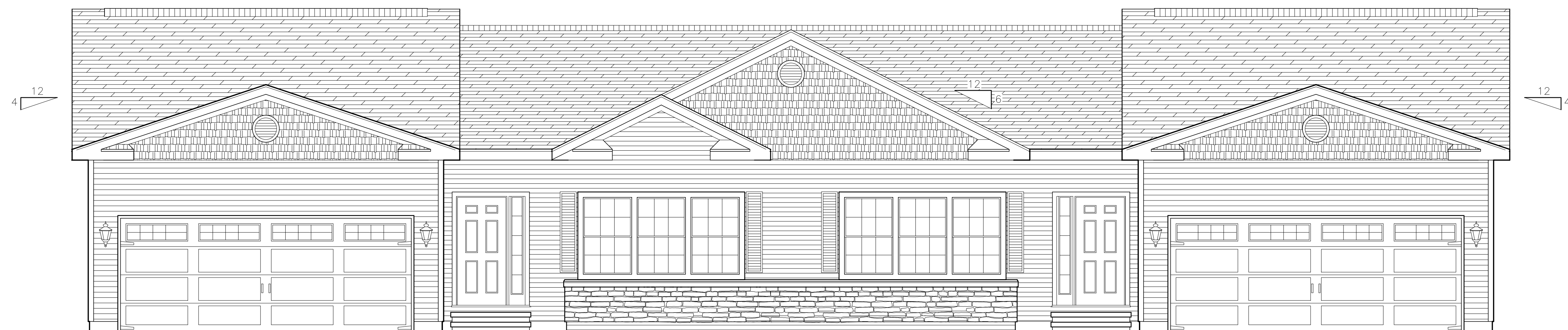
1 FRONT ELEVATION A1.1 SCALE: 1/4"=1'-0"